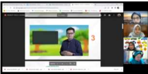
Picture 3. Coaching for Digital Learning Video with Expert