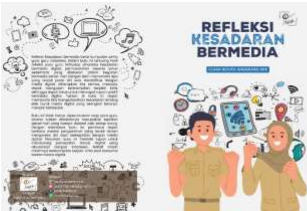
Picture 4. Book of Learning Articles written by Participants