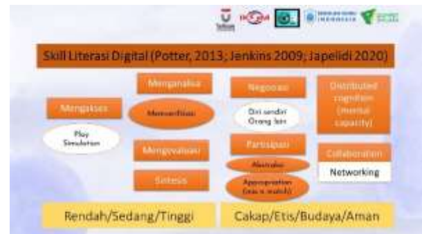
Picture 1. Critical Digital Literacy Skill Materials (Potter, 2013; Jenkins, 2009; Japelidi 2020)

In addition to providing materials, our Community Development team also provides a discussion room. These materials hopefully able to make the teachers understand more and improve their digital literacy skills. So that, after joining this training their capacity for teaching and educating their students will be increase.