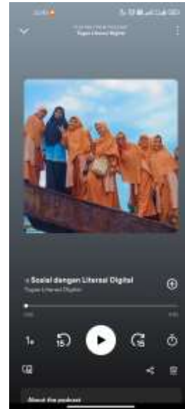
Picture 5. The Best Digital Learning Podcast by Participants

Unfortunately, only one podcast fulfills the criteria of digital learning content, the other podcast by participants did not fulfill the grade criteria. For digital learning video, there's no one who can fulfill the grade criteria. Besides, the learning article written by participants fulfills the grade criteria after coaching with expert. The revised process needed at least three times after proofreader by trainers' team and expert.