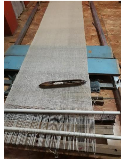
Image 1. Abaca fibers weaving process

6) Communicate with the bags and shoe vendor in Bandung. ; 7) Coordinate with COFO Indonesia in promoting and selling the products through websites and other social platforms.